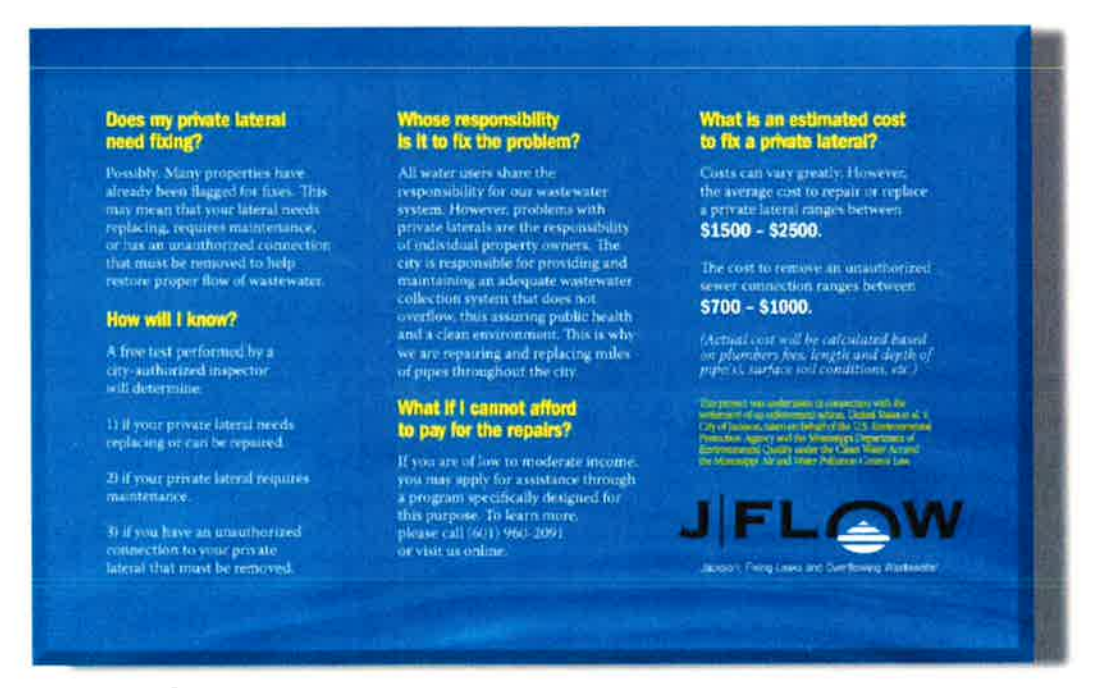
Back of card